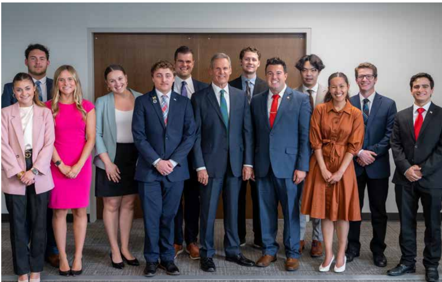
A few Nashville Summit attendees pose with Tennessee Governor Bill Lee following his address to the students.

M usic City is famous for launching the careers of some of the most notable names in the music industry.