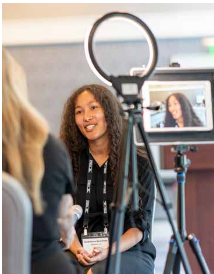
At the Summit, attendees hone their media communication skills with workshops from District Media Group

Over 50 young conservative leaders attended the Nashville Summit for five days of hands-on training including media training from District Media Group, a campaign simulation with our friends at American Majority, and a full legislative simulation where they wrote their own legislation, took it through committee, and presented it to