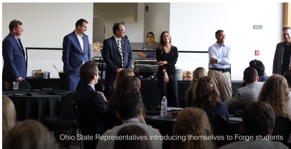
Ohio State Representatives introducing themselves to Forge students